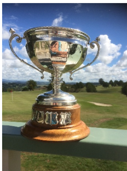
The Le Garth Trophy held by Hikurangi Golf Club

The challenge will be played on Sat 23 Aug over 18 holes starting at 10 am. Our best wishes go to our team in what is a very prestigious and demanding competition